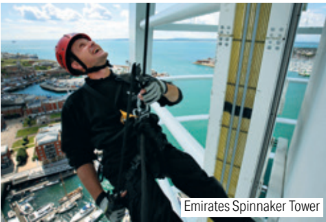
Emirates Spinnaker Tower

Portsmouth offers a wealth of great experiences that can be added to any of the tours.