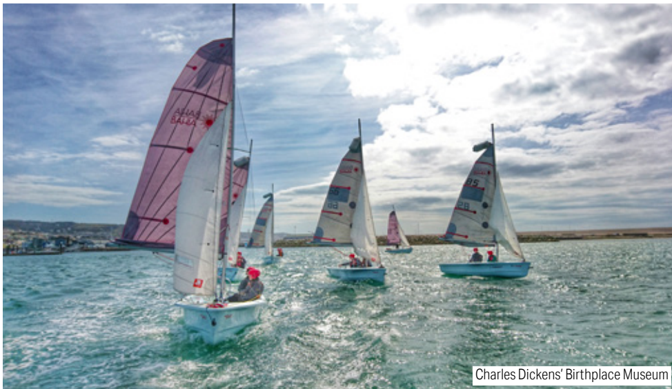
Charles Dickens' Birthplace Museum