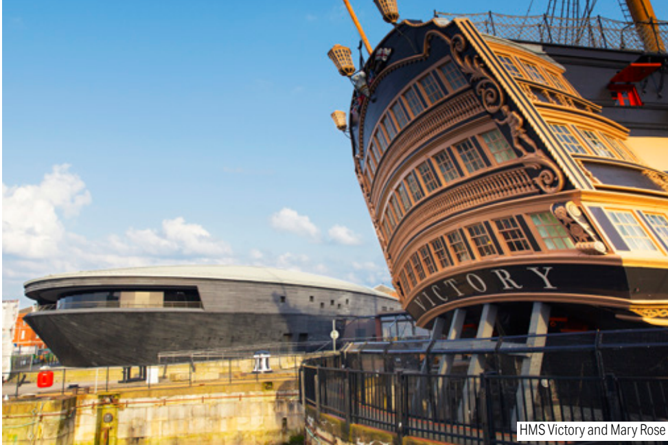
HMS Victory and Mary Rose

Portsmouth on England's south coast is an ideal location for a full or half day group visit.